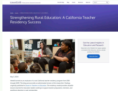
Strengthening Rural Education in Kern County