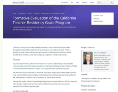
Formative Evaluation of California's Teacher Residency Grant Program